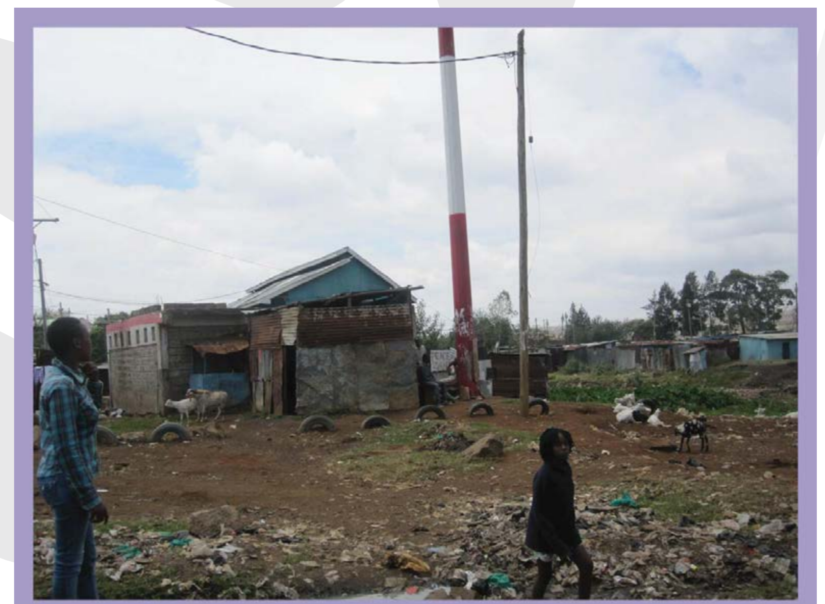
Young mothers look for old plastic and metal at the dumpsite to resale for an income