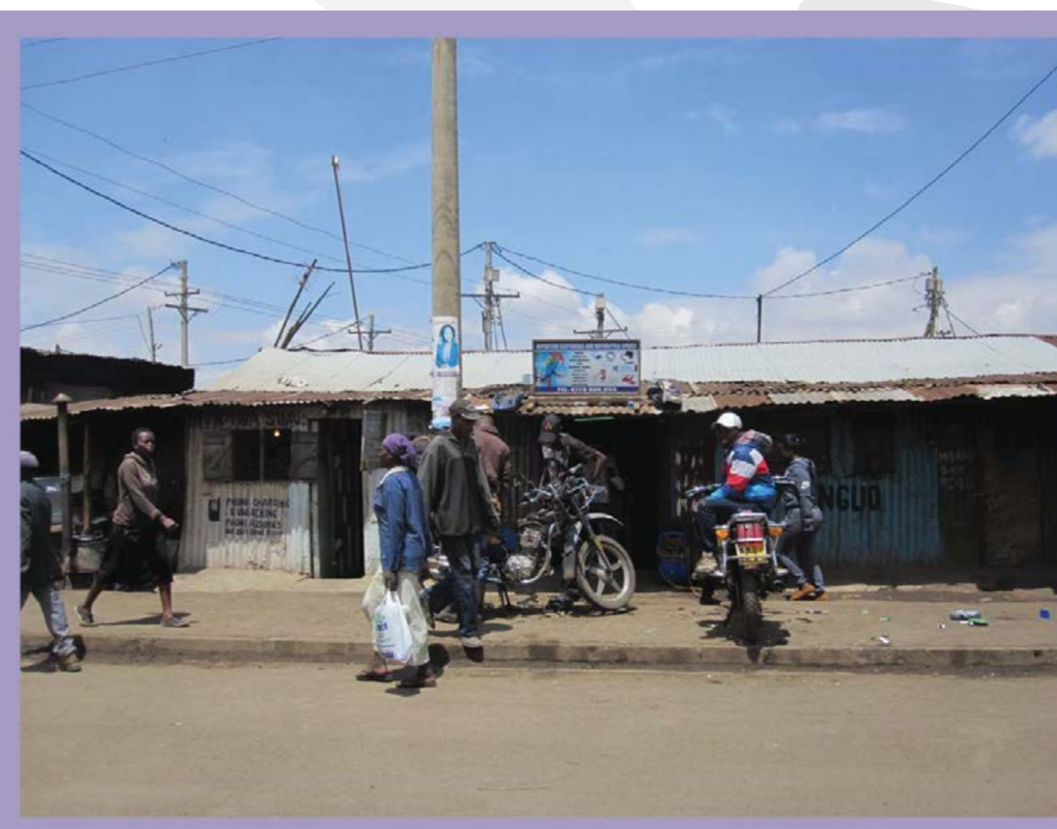
Lack of jobs make young men to engage in irresponsible behaviours