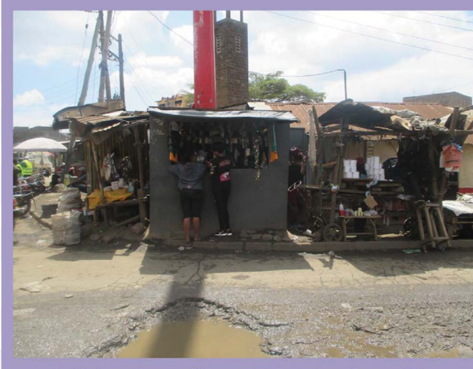
Small businessmen lure young girls into sexual relation in exchange of money and gifts