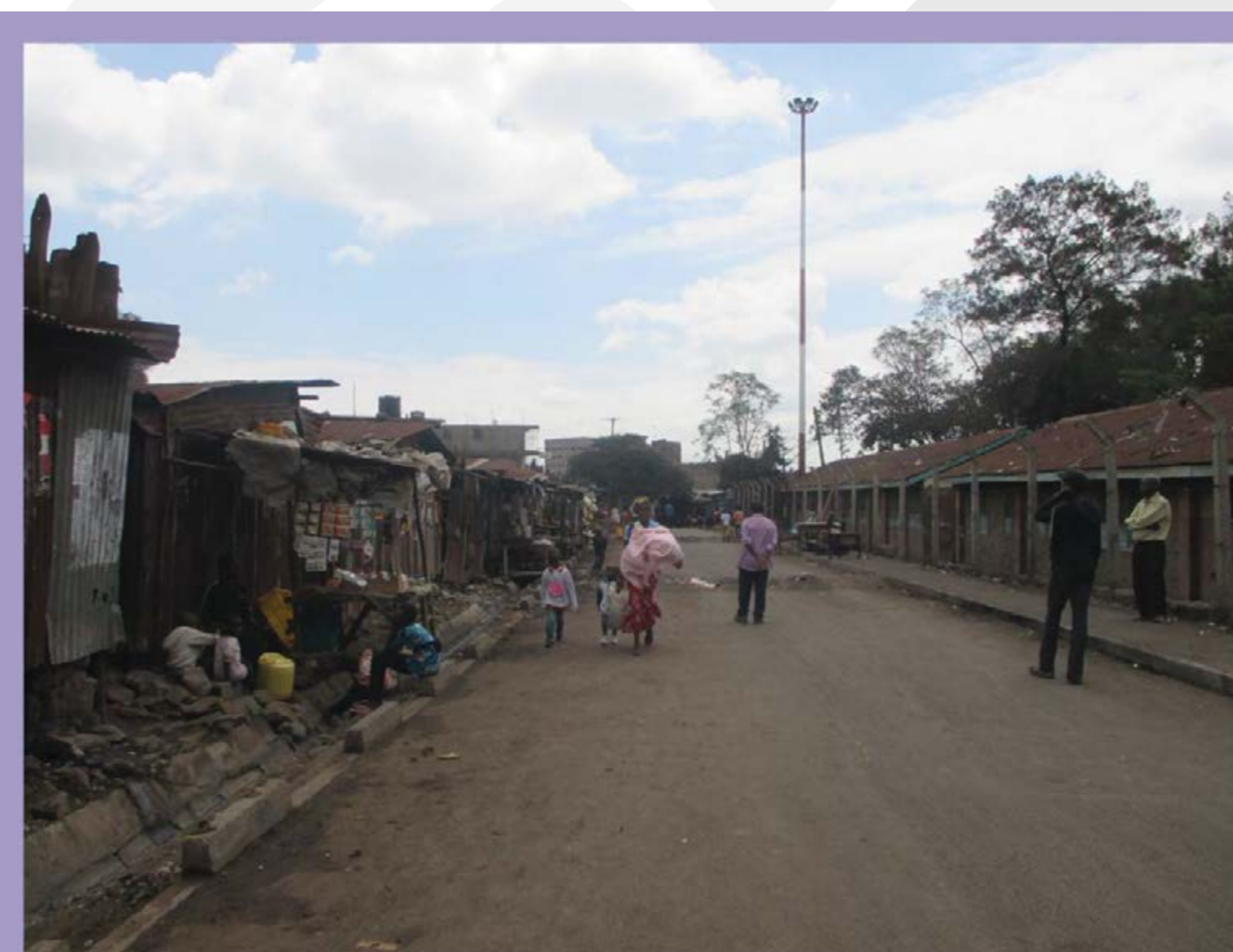
Multiple responsibilities prevent teenage mothers from returning to school