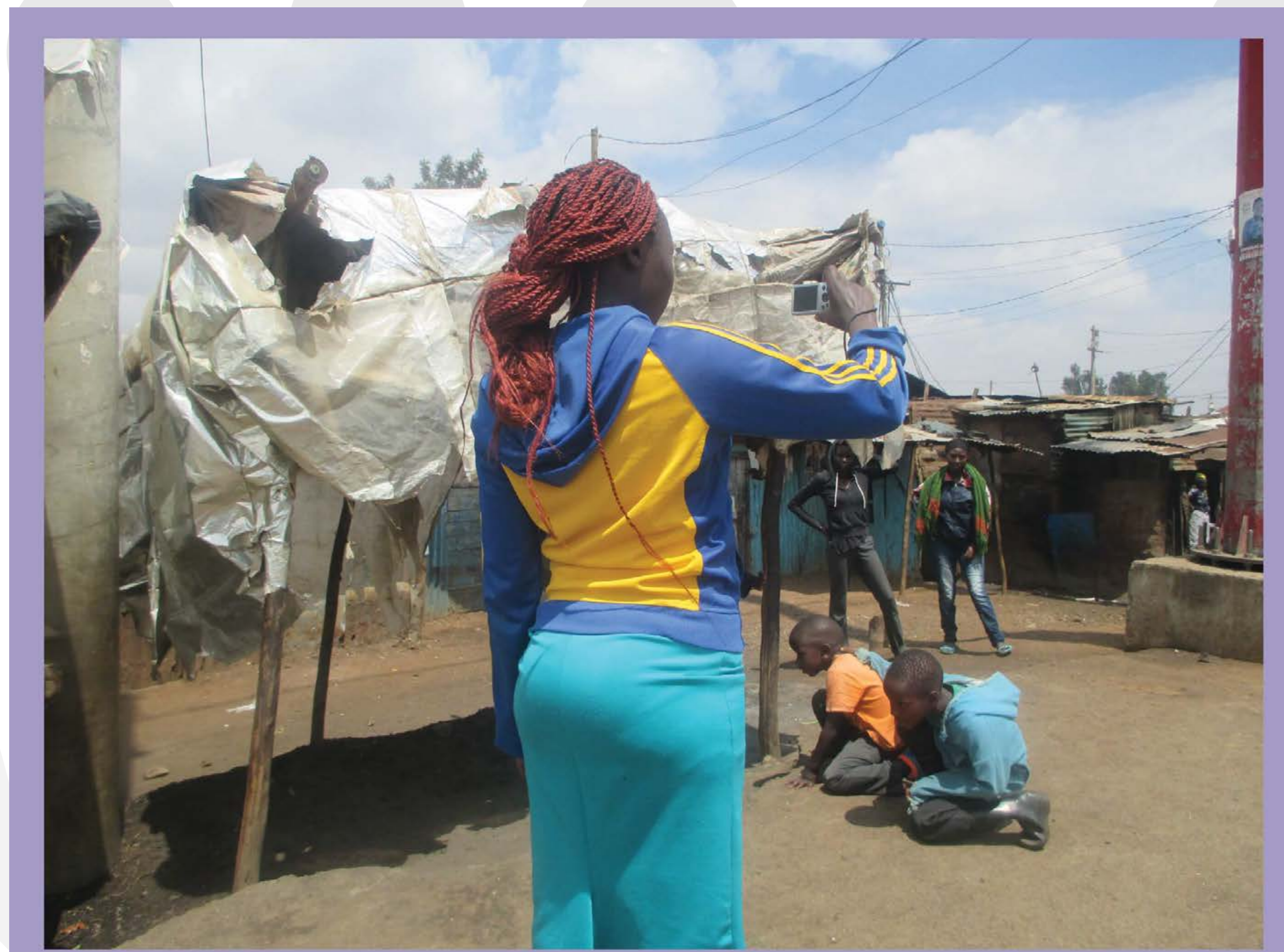
Teenge mothers have to stay home with their children

Teenage pregnancy is one of the major causes for girls dropping out of school before completing a full cycle of basic schooling, especially in sub-Saharan Africa. Fifteen young mothers between the ages of 14 and 19 years and living in Korogocho, one of the largest slums in Nairobi, Kenya, participated in a Photovoice project using the prompt: "What are your challenges as pregnant girls and young mothers in this community?" Their more than 100 pictures and photo narratives tell the story of the challenges of being young mothers and living in marginalized contexts such as urban slums. The pictures highlight the multiple and intersecting factors that put them at a higher risk of discontinuing school despite the presence of school continuation and re-entry policies.