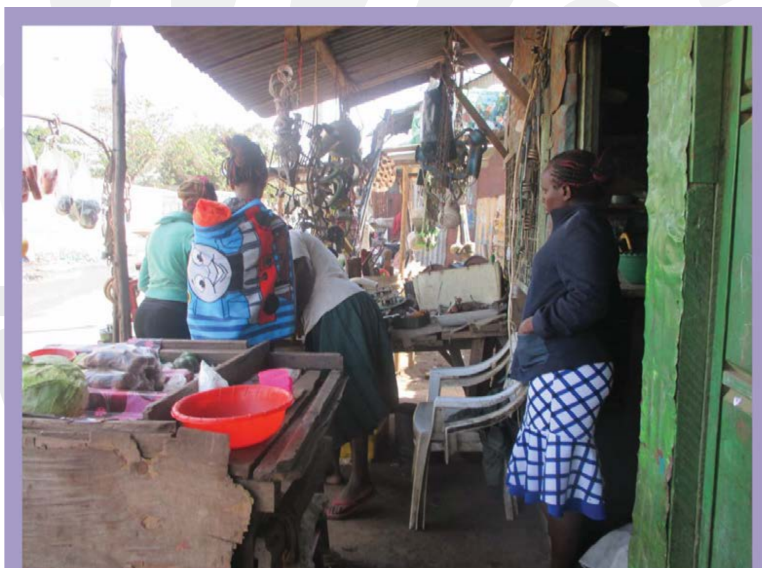
Teenage mother helping in family business with her child on the back