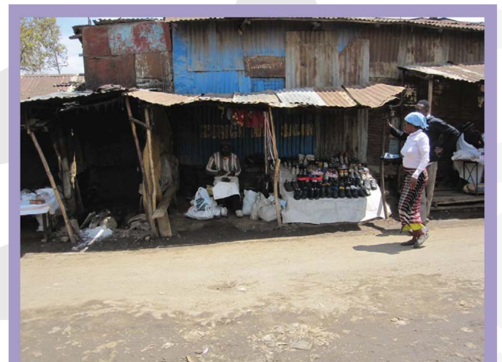
A teenage girl is looking for employment