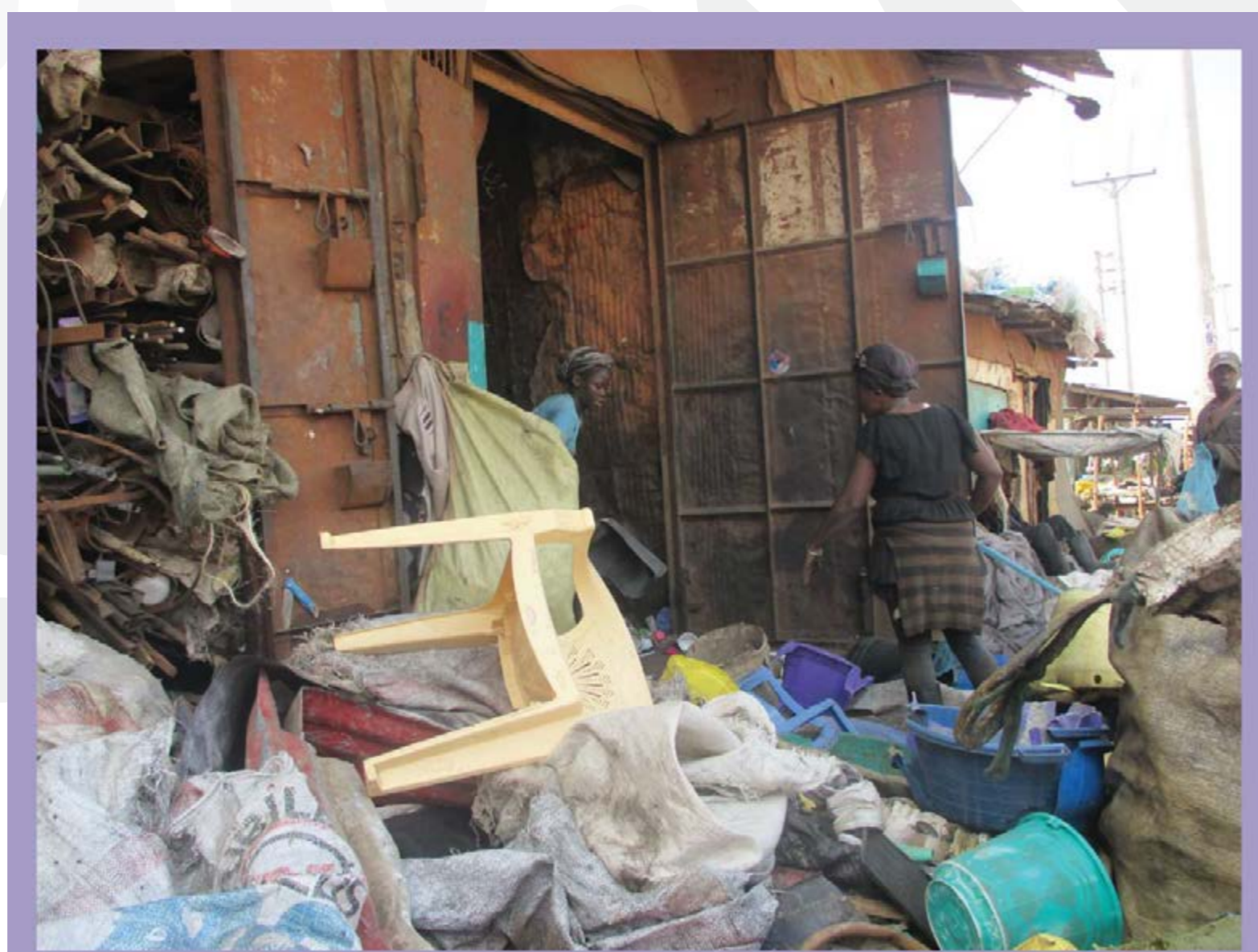
Young mothers have to do odd jobs to earn a living