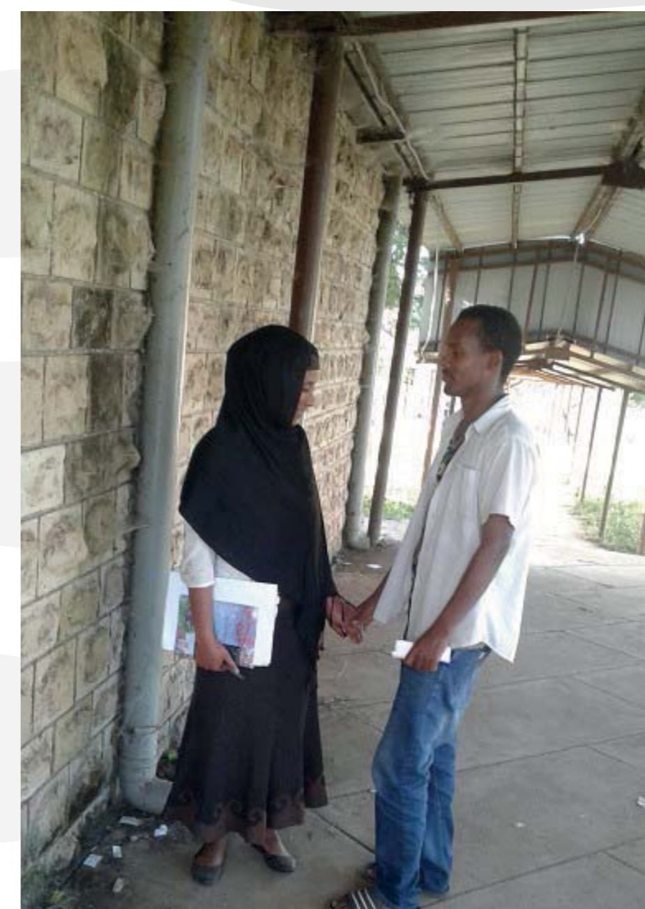
Dark roads prone women to harassment or the roads from library to their dormitory are dangerous for female students especially when they came back at night time.