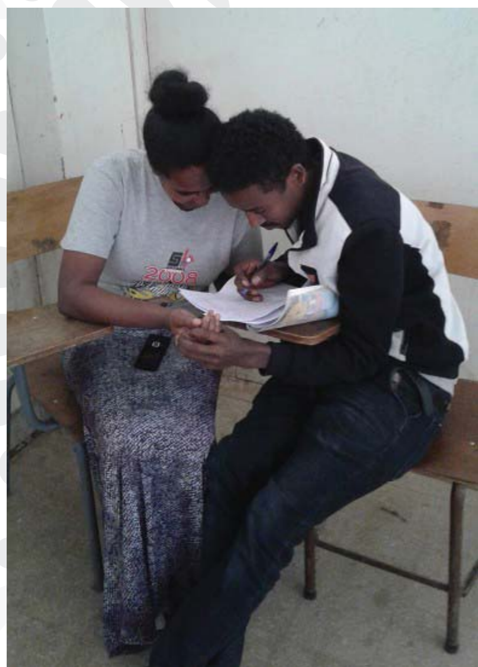
Gender inequality problems starting from family level make female students incompetent up to their life time and this make them dependent on male students and this make them simply to expose for harassment.