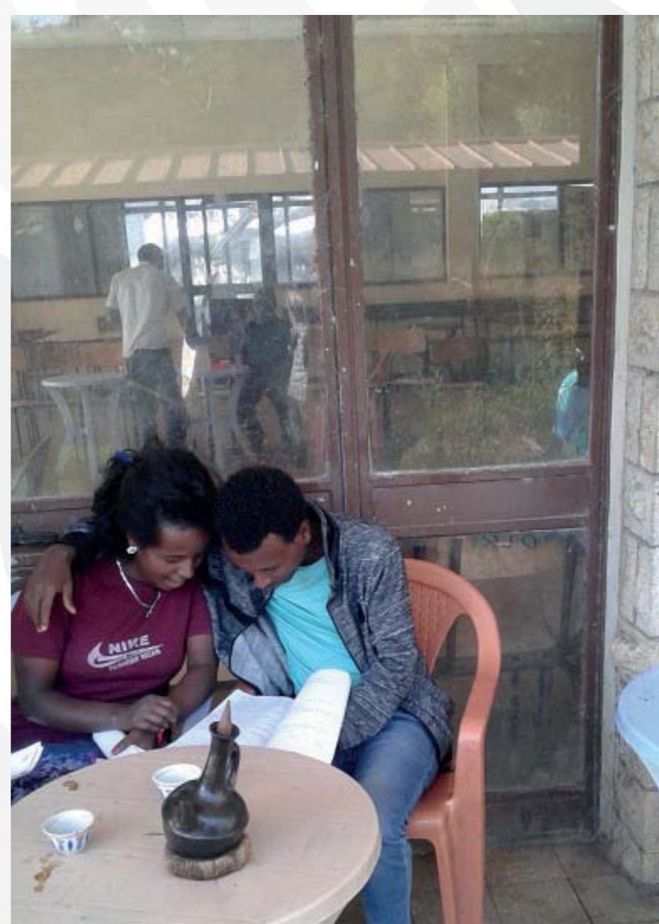
Female and male students may confront at small hotels around the college just for refreshment. But these places are the other harassment sites. There may be places facilitated by the owner of the hotels as income generating activity.