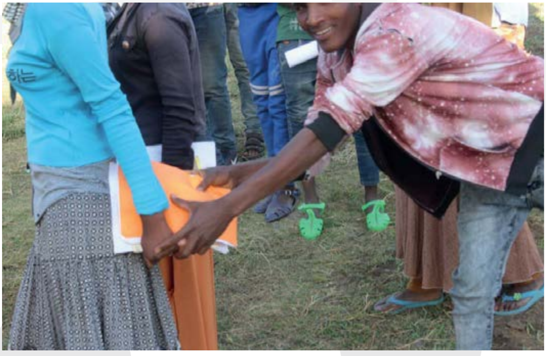
Taking away her exercise book