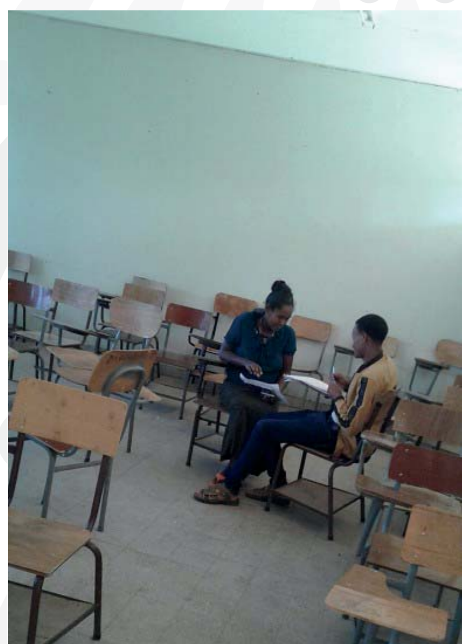
Open classrooms are also the harassment sites that male students take advantage of helping female students in need of help at time different exam times.