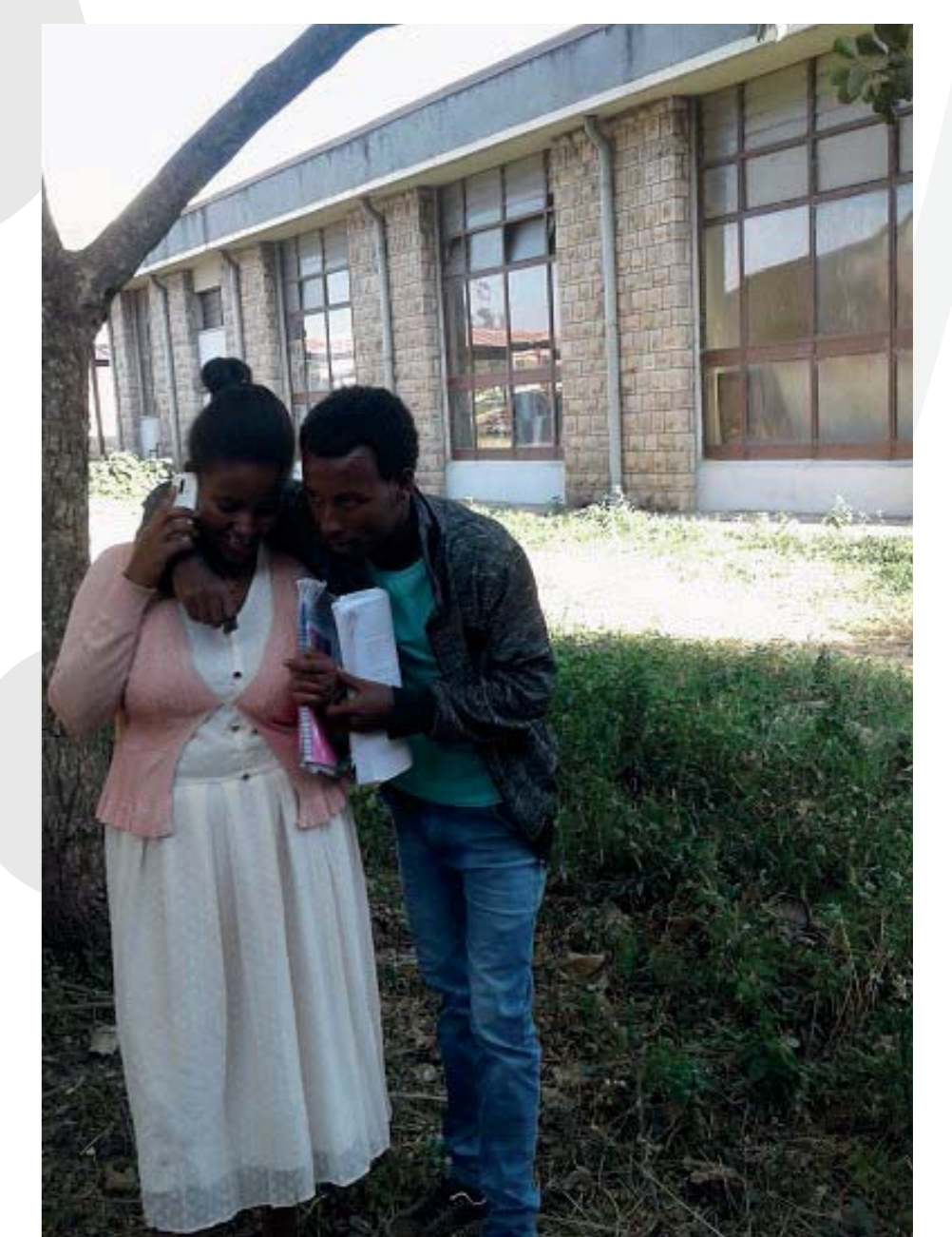
One of the cases for harassment up on female students is in exchange of cellphone.