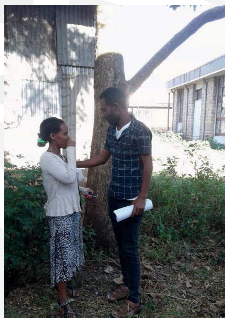
Sexual harassment at college level results in an expected pregnancy, HIV and AIDS and psychological and moral destruction on the female side and finally affect their family, they may remained workless also affect their productiveness at their work place and indirectly affect the country in every aspect as a whole.