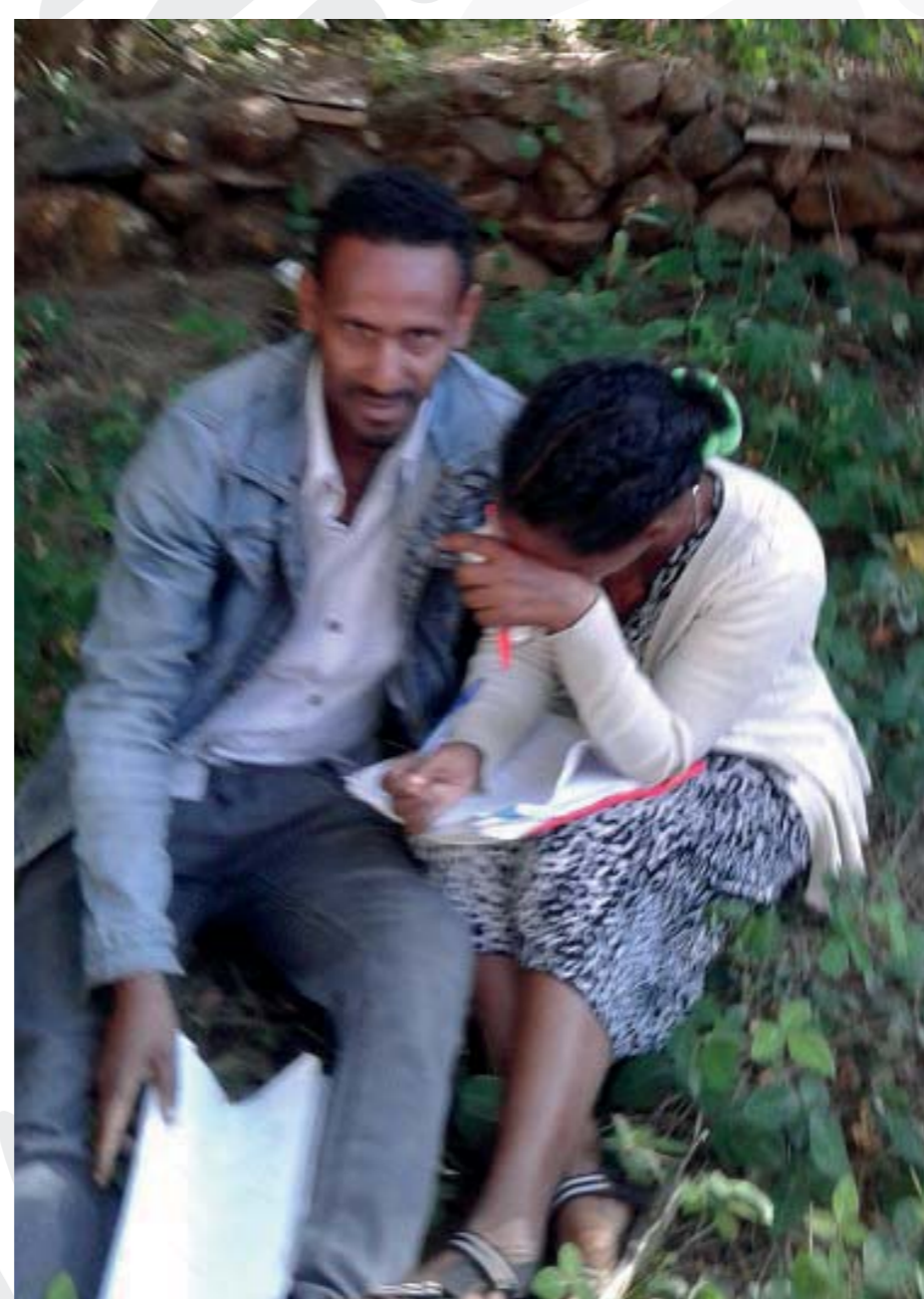
When the exam approaches especially female students become tensioned and obliged to answer all the questions that comes from male students and then they can exposed to harassment.