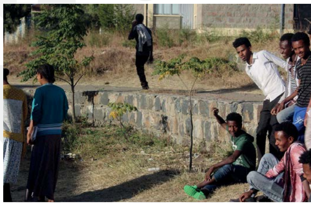
Intimidating female students when they walk in the campus

There are a large number of female in the class room but they are less success due to work load or domestic work.