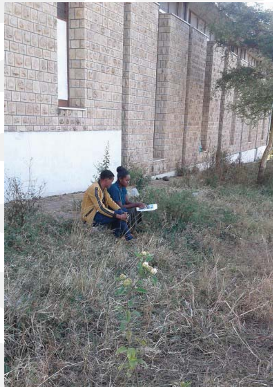
Female students studying at the building backs with males experience harassment as male students urge them to go with them to study there.