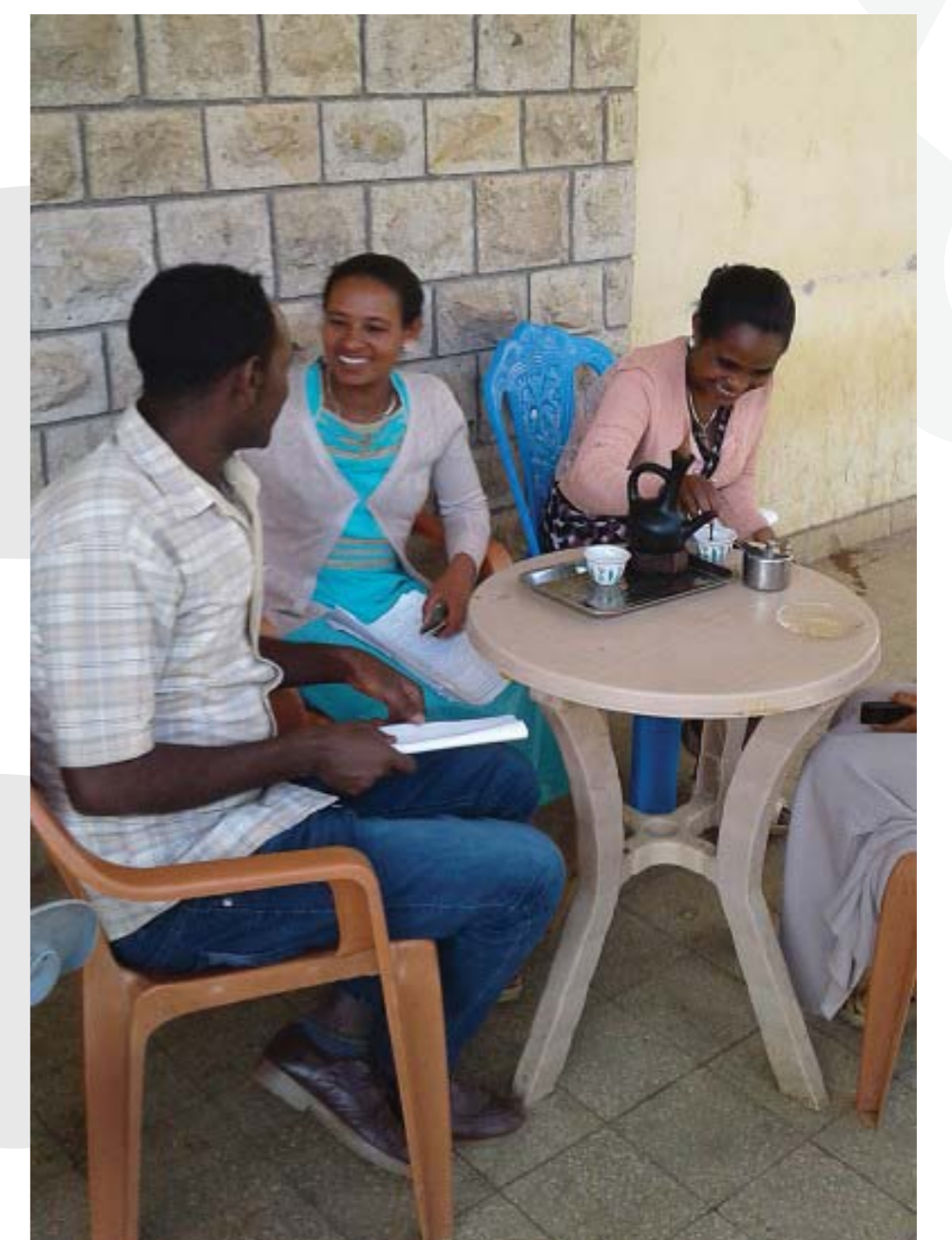
Peer pressure is one of the causes that can expose female students for harassment.