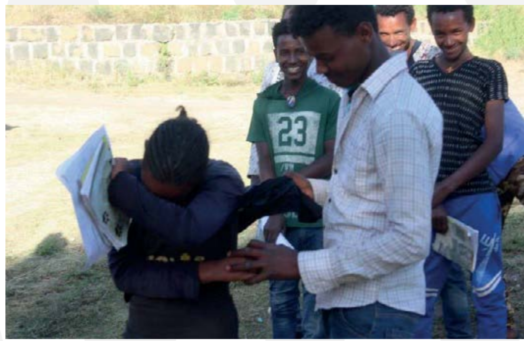
Physical and verbal harassment

These photos were produced by male and female students (between the ages of 17-23) from four agricultural colleges across Ethiopia in response to the prompt 'making our campuses safe' under the aegis of the ATTSVE (Agricultural Transformation Through Stronger Vocational Education) project. The colleges (Nedjo, Maichew, Woreta and Wolaita Soddo) are largely located in rural regions, close to smallholder farming areas. Not unlike the situation in many colleges and universities in both the Global North and Global South, power imbalances and gender inequalities often lead to unsafe classrooms and unsafe living conditions. The photos highlight the ways in which the voice of students can be key.