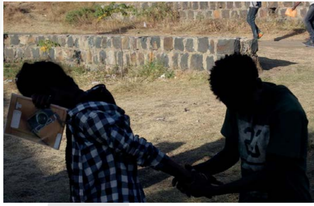
Asking for something by force