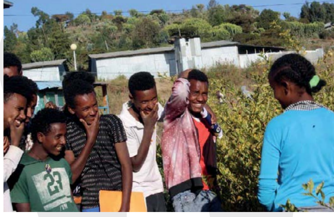
Male students undermining the female students when she engage in practical session